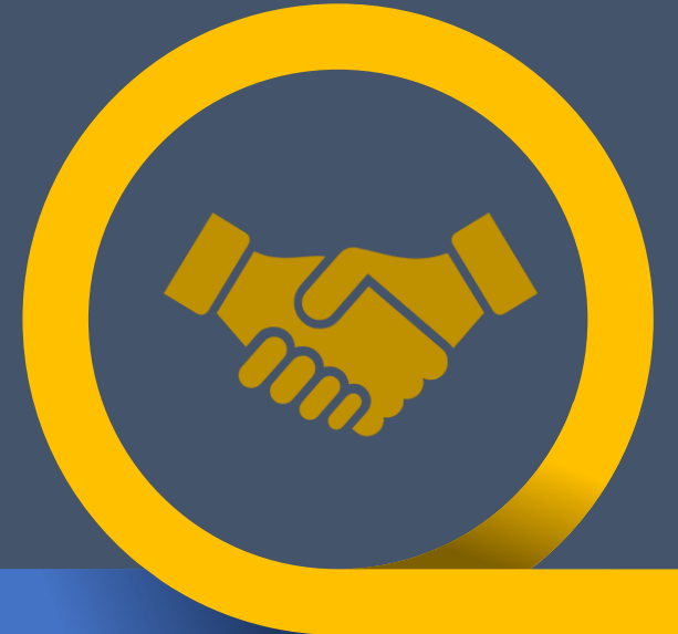
Digital Developments for citizens